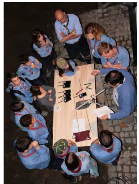
How to catch a radio fox, explained in Italian.

The scouts in Castellamare di Stabia (near Naples) were really pleased to find scouts in Venezuela who spoke a perfect Italian!