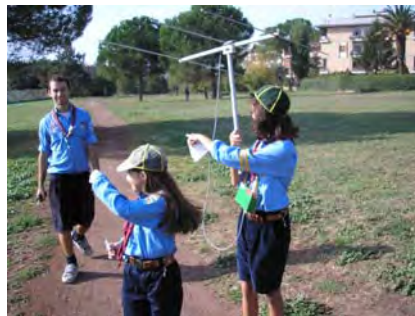
"a little bit more to the right.... don't you see the radio fox now?...."

Alternative power sources were explored by Genova Scouts, doing many experiments on the matter. They got electricity from tin cans, filled with bleach, and they even built a "human battery"!